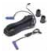
TMF Pair of photocells for optical type sensitive edge. Pc/pack 1