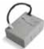
PS124 24 V battery with integrated battery charger. Pc/pack 1