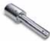
CRA9 Adapter for diameter 31.75 (1.1/4”), 35 and 40 mm shafts. Pc/pack 1