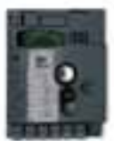
SOA2 Spare control unit for SO2000.