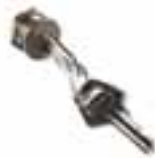
CM-B Pawl with two metal release keys.