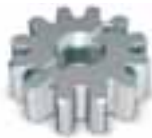
RUA12 12-teeth pinion, module 6, to be coupled with rack ROA81. The Run automation is supplied with a module 4 pinion to be used with the standard racks ROA7 and ROA8. Pc/pack 1