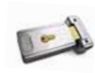
PLA11 Horizontal 12 V electric lock (required for gates longer than 3 m). Pc/pack 1